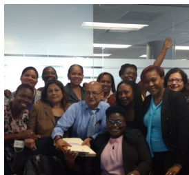
Guidance and Counselling Middle Management Team