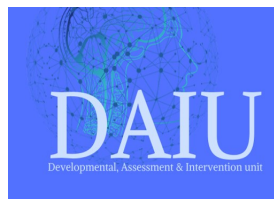
The Developmental Assessment and Intervention Unit Logo